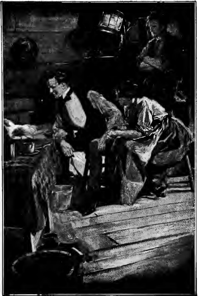
The vigil continued far into the night and until the gray dawn streaked the sky.